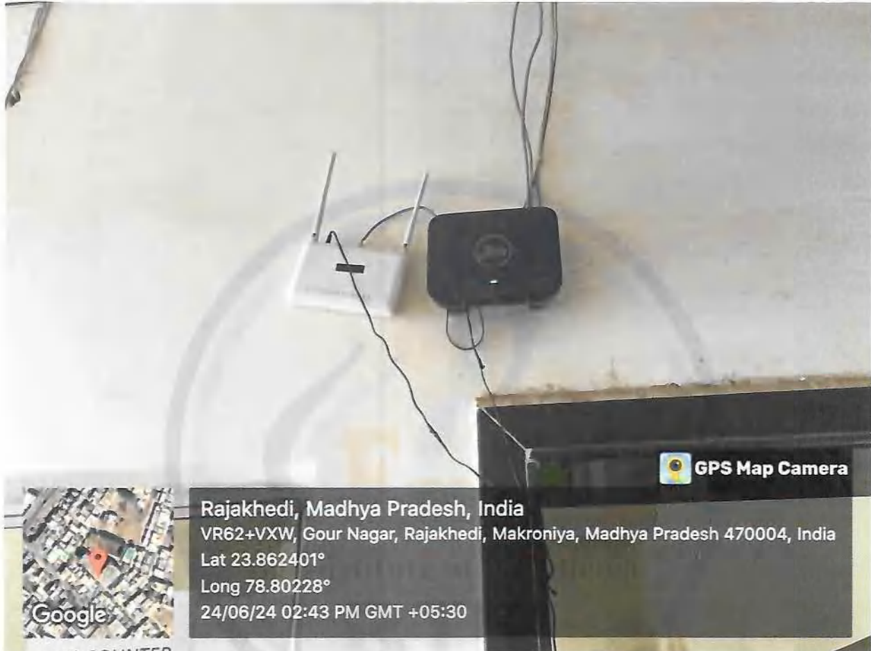
WIFI Point- 1 (JIO)