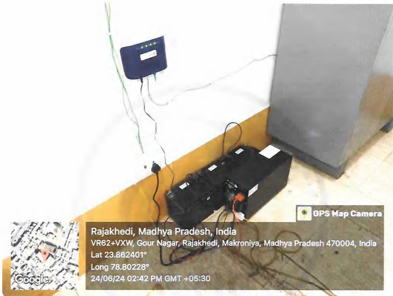
WIFI Point- 3 (Arjun)