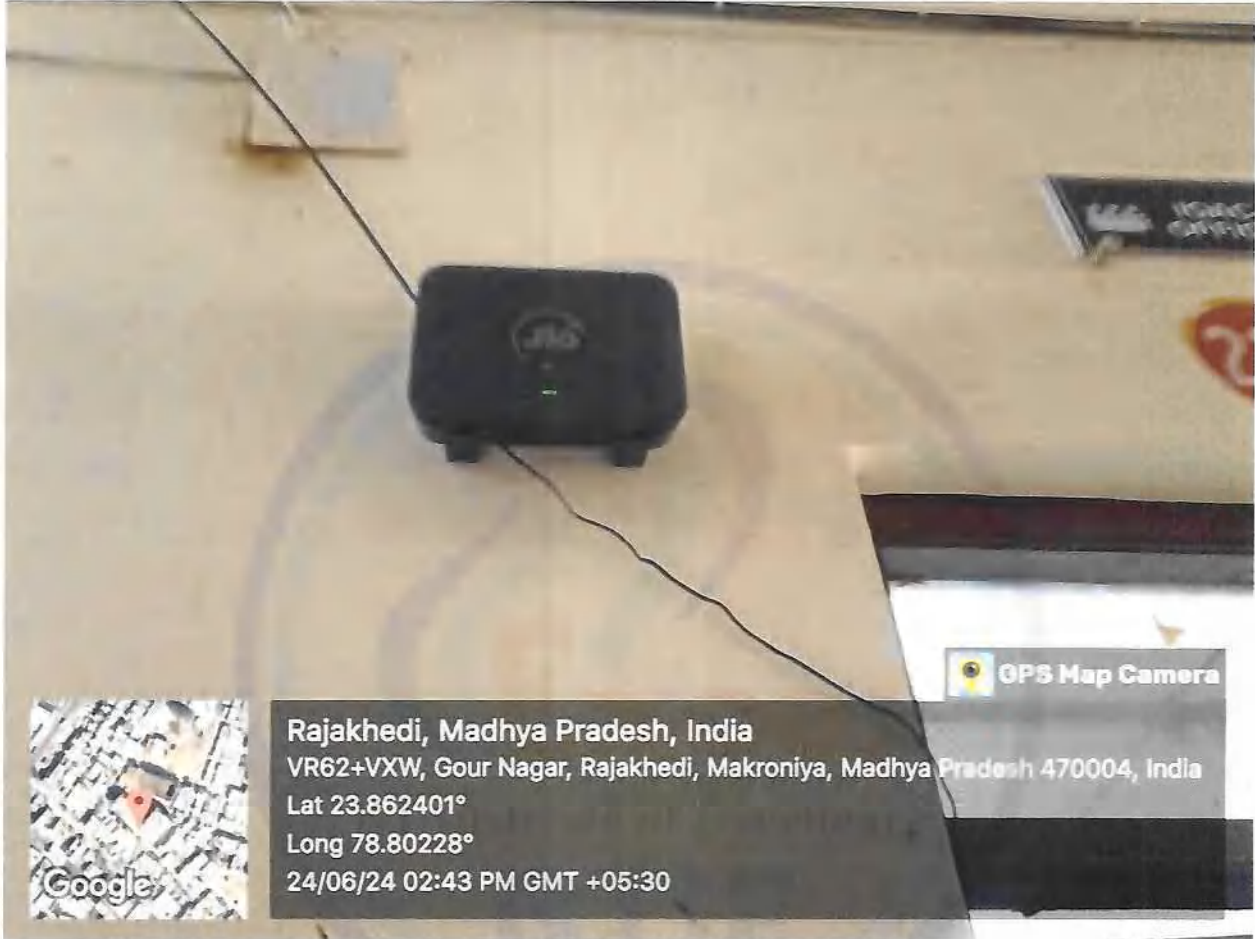
WIFI Point- 2 (JIO)