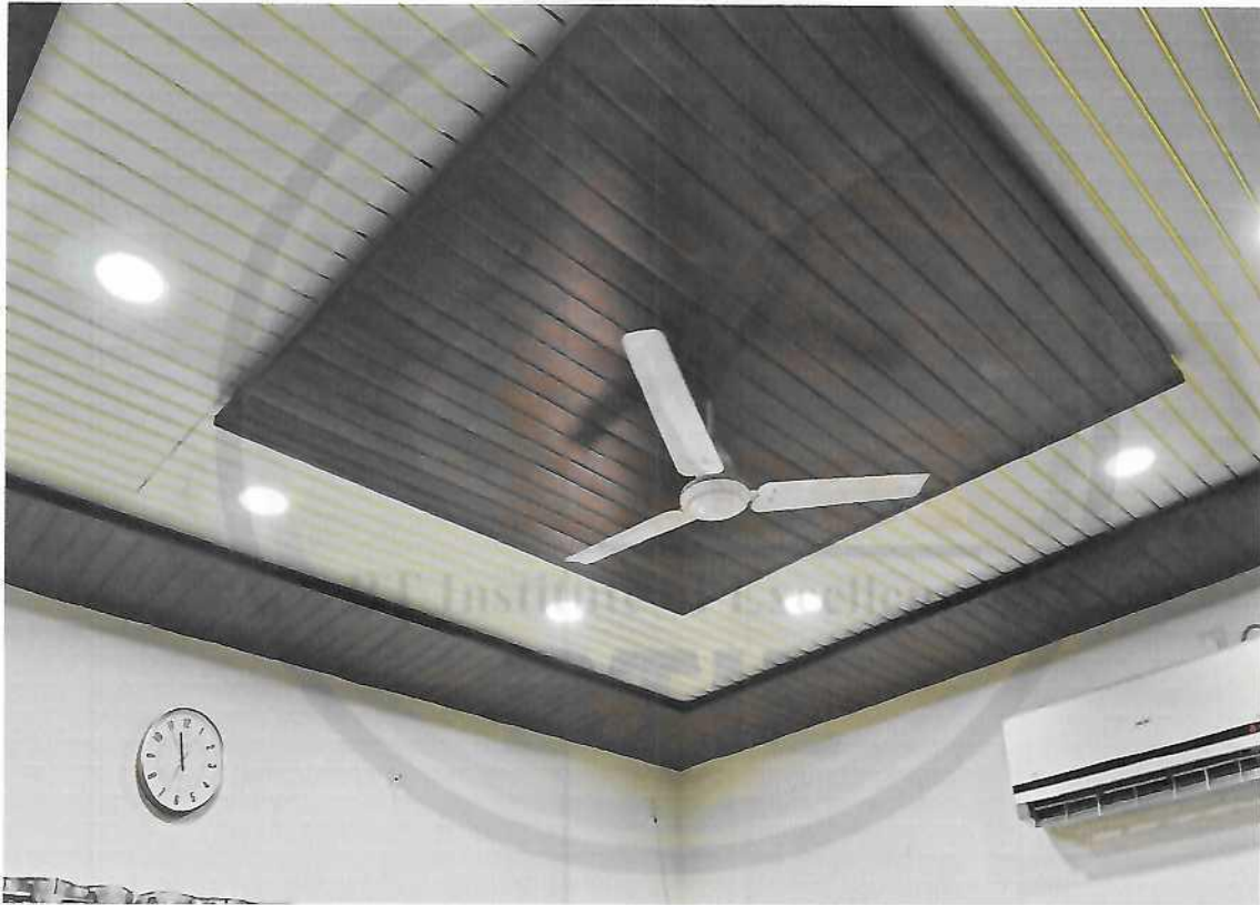
BTIE DIRECTORS ROOM LED BULBS