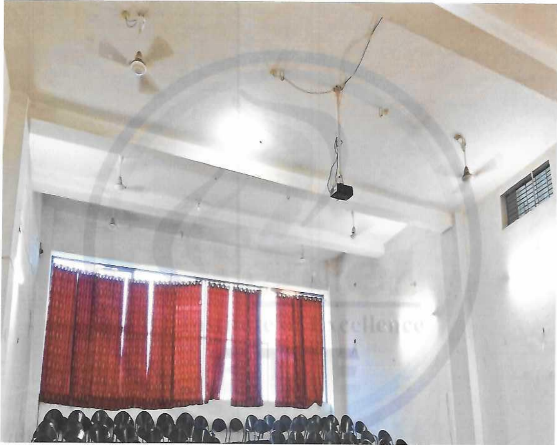
BTIE AUDITORIUM LED BULBS