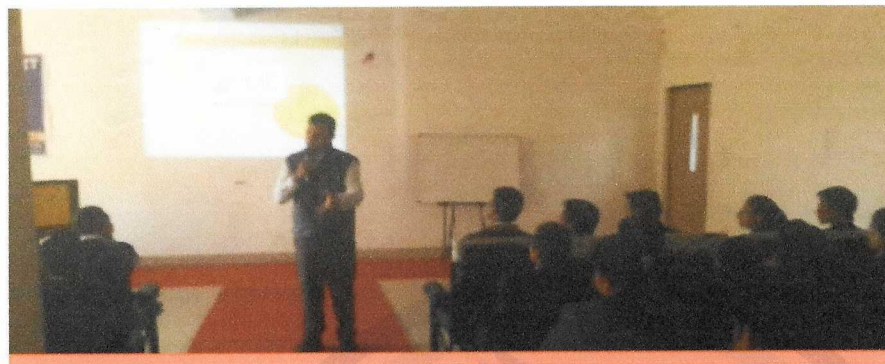
Expert Lecture Report: BTIE Sagar Students