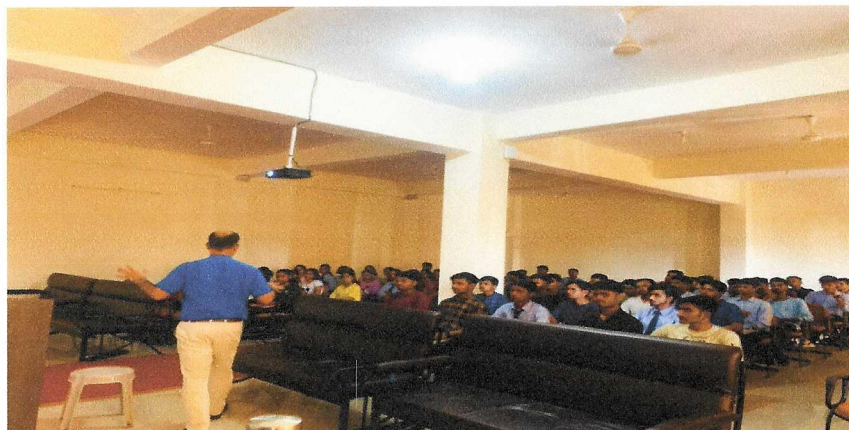
Seminar Report: BTIE Sagar Students